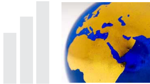
Table of Contents & Order Form

Strategic Directions International, Inc.